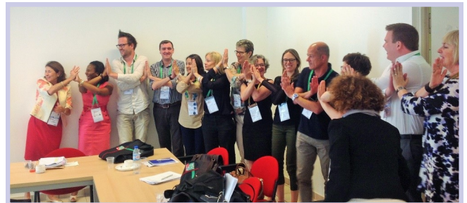
Members of the EULAR Standing Committee for Health Professionals in Rheumatology - High 5 for World Arthritis Day

highlights, Rome provided a wonderful backdrop to EULAR 2015 and, a few travel limitations notwithstanding, made for a memorable week.